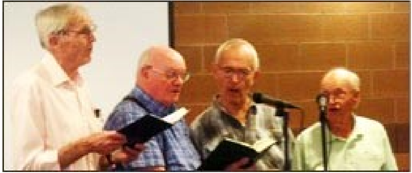
The Lehi Chapter Quartet

The August dinner meeting was held at the south west corner of Wines Park (500 North Center St.) A wonderful dinner of slow cooked prime rib from One-Man-Band Restaurant and soft-serve ice cream for dessert was served, along with baked potato, vegetable and a roll. The entertainment was provided by The Accords , a duo of accordion players.