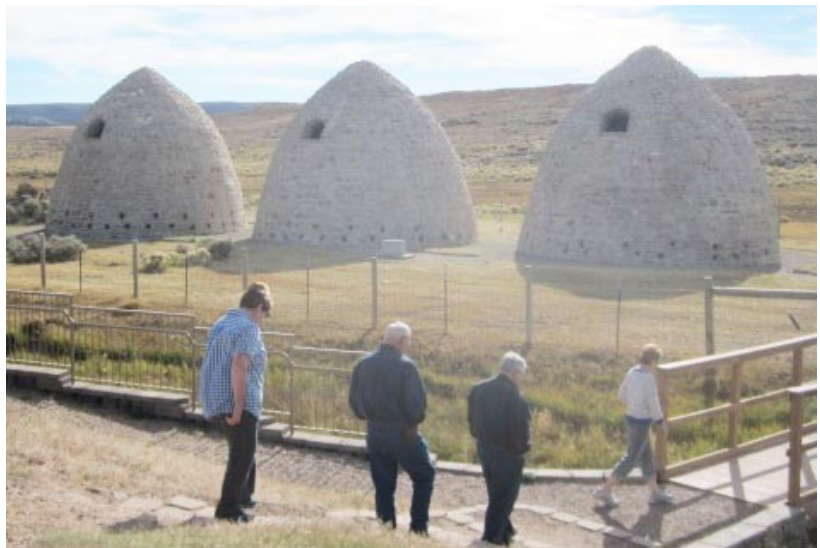
Chapter members at the Charcoal ovens

From Piedmont, the Pioneer Trail traveled up and over the hills to the west where traveling was easier than dealing with the meandering streams in the valley. On the top of these hills is "Brigham's Arrow" which pointed the way for the following