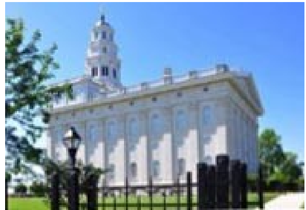
The "New" Nauvoo Temple

The City of Nauvoo, Illinois is a huge attraction to members of the church today, as well as for many others who are curious. There is so much of our history of the church there.