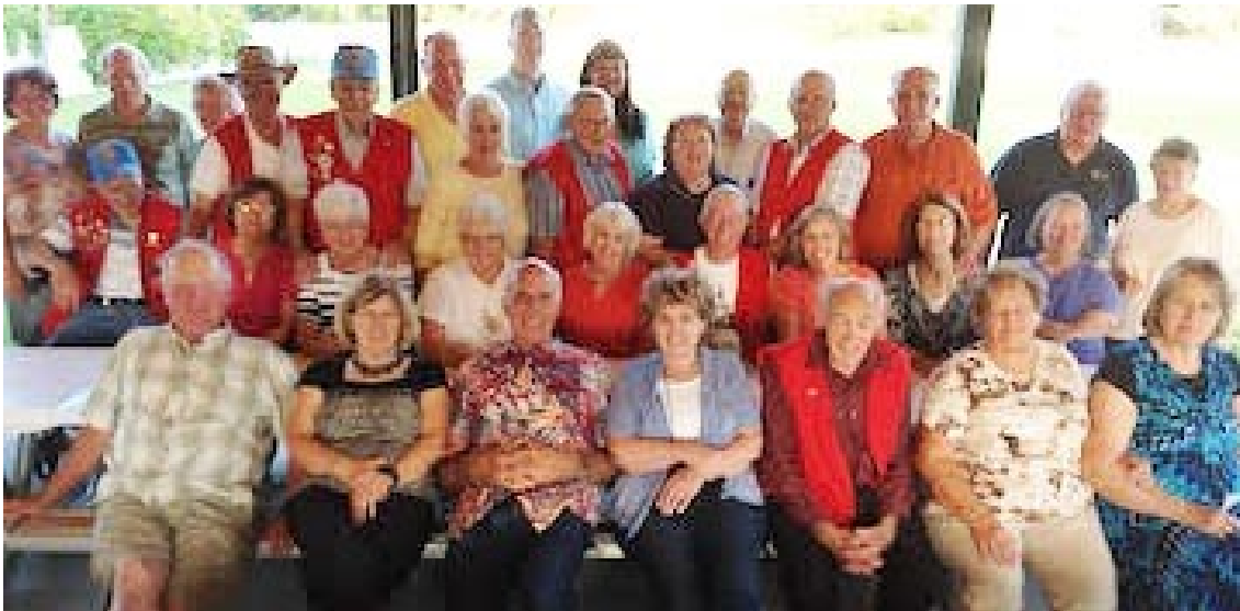
The Jordan River Temple Chapter members at their outing.

On Wednesday, September 2, we enjoyed our annual gathering of Chapter members and guests at our “beginning of the fall season” picnic. What a delight to see you all again, and to renew our friendships.