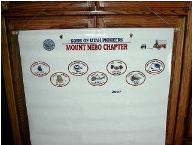
Nebo Chapter Banner

meetings where they can be displayed. This represents the first chapter awards given under the new Awards program initiated at the Heber City Convention in 2006, and covered the period from July 1, 2006 to December 31, 2007.