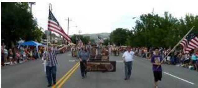
The weather was overcast and nice. Fun was had by all.