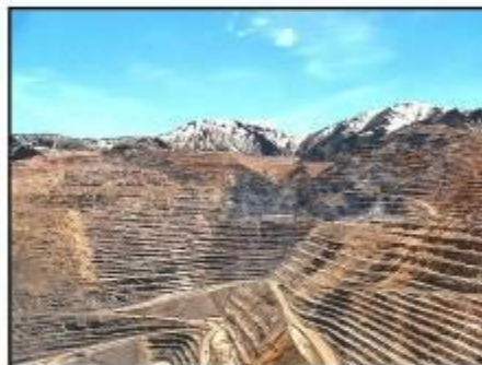
Open Pit Copper Mine

Leaving the hotel we stop at nearby Fort Douglas much of which was beautifully restored and used for the Olympic Village in 2002. We find the curator at the museum very engaging and informative in telling the story of the military co-existing with the Mormons. Brigham Young was aware of the rich mineral deposits in the mountains, but asked the Saints not to develop mining or talk about it, thus preserving their comparative seclusion for a time. When Colonel Patrick Connor arrived and confiscated thousands of acres of land, Red Butte Canyon and Stream to set up Fort Douglas in 1862, he soon sent his men into the mountains to prospect. He was determined to dilute the Mormon population by creating a mining rush, and he succeeded.