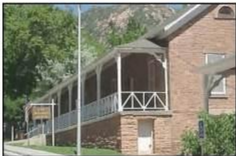
Fort Douglas Museum

to the smelter on the south shore of the Great Salt Lake. We stop at the marina and learn how this “dead sea” is really a treasure trove of wealth to our economy with its salt, minerals and multi-billion dollar brine shrimp industry. Wade in, see the shrimp, and taste the salty water if you choose.