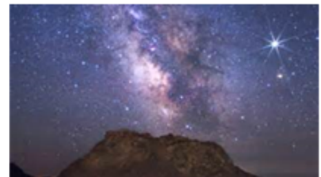
Craters of the Moon

WEDNESDAY: After an included breakfast, we explore Craters of the Moon National Monument at the base of the Pioneer Mountains. A seven-mile loop drive reveals basaltic volcanic features, lava fields and cinder cones with large central vents. In Idaho Falls we visit the impressive Museum of Idaho which presents the story of Idaho from pre-historic times to the atomic age including the