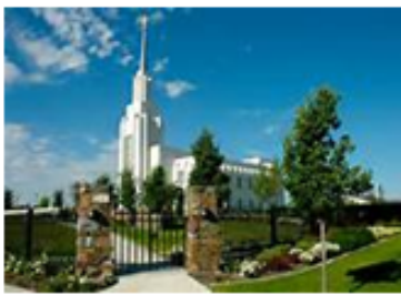
Twin Falls Temple

THURSDAY: A morning session in the Rexburg Temple is optional. At the Rexburg Family History Center we offer a class on Family Tree and/or Indexing. Shuttle service to and from convention venues is included.