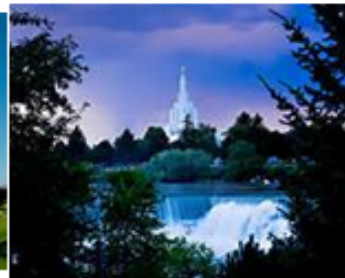
Idaho Falls Temple