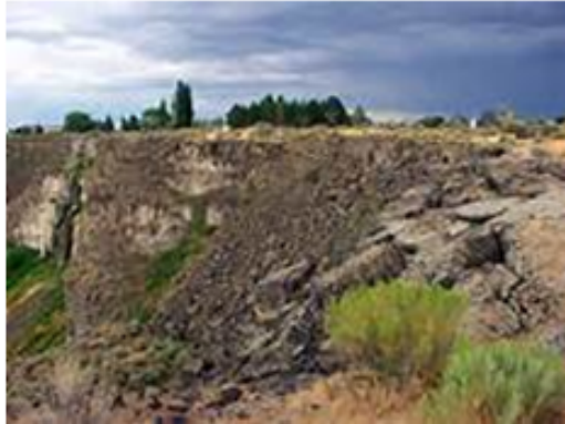
Snake River Canyon

Join us for the Pre-Tour and/or Post-Tour transportation to the Sons of Utah Pioneers National Convention in Rexburg, Idaho. It's an opportunity to enhance friendships and increase your enjoyment of the entire event. Make your convention reservations early and choose the Springhill Suites by Marriott for your hotel as the pre-tour will be staying there on Wednesday night. Space is limited. Reservation deadline: JUNE 15, 2013 (after that date, please call for availability).