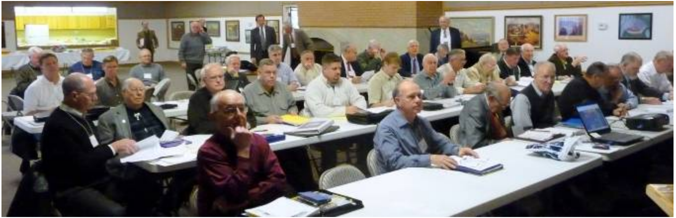
Above: Chapter Presidents attending Council Meeting