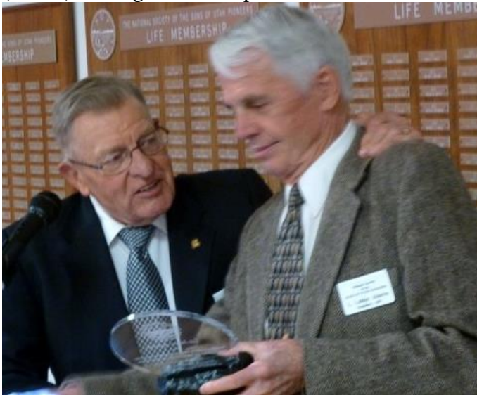
years of leadership in the Executive Council as President Elect, President, and Immediate Past President. This gave us the opportunity to recognize their outstanding devotion and service to the National Society of the SUP.