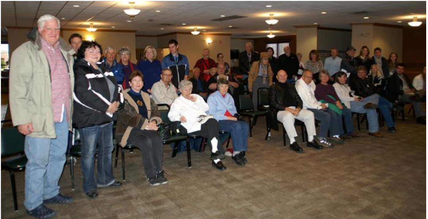
Those standing in the photo of dedication attendees above are descendants of the Austin family.