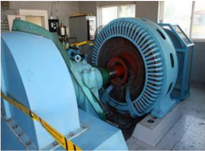
One of two hydro-electric generators at the Brigham City Power Plant visited by members of the Box Elder Chapter.