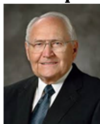
Elder L. Tom Perry of the Council of the Twelve Apostles