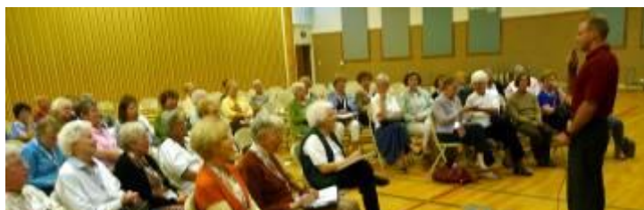
Ladies Breakout Session