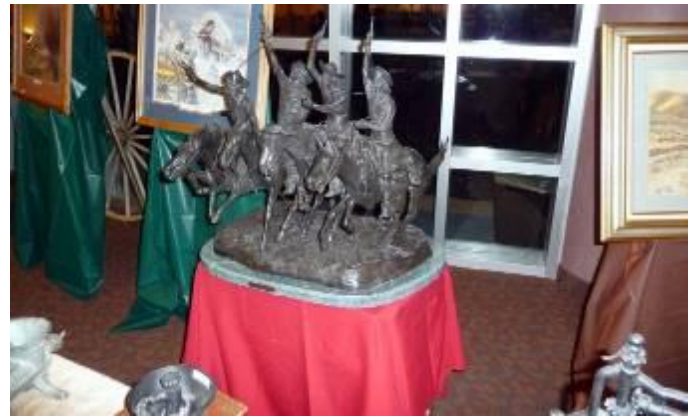
A variety of art work displayed at convention