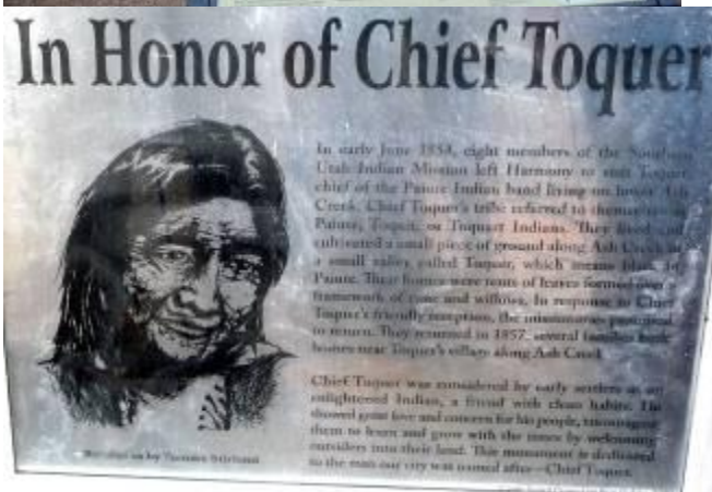
How Toquerville got its name.