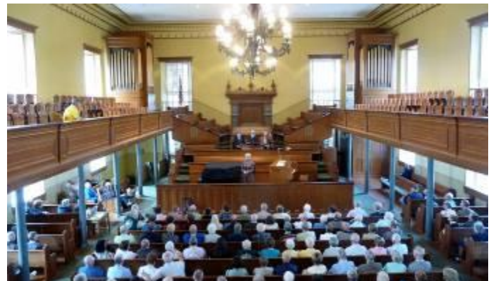
A group at one of the tours