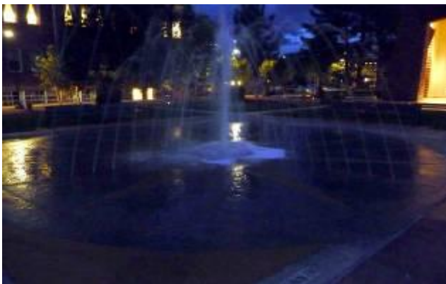
Night-time view of St. George Square