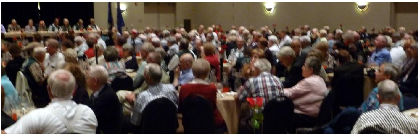
Opening Ceremony Dinner