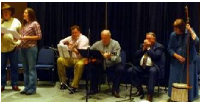
A family band playing at the Opening Ceremonies Dinner