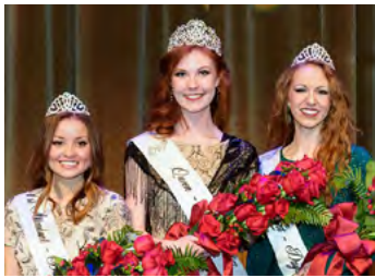
Days of '47 Royalty