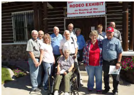
Box Elder Trek