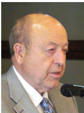
Senator Lyle Hillyard

At the June meeting, Senator Lyle Hillyard reported on some of the important events in the 2017 Utah legislative session.