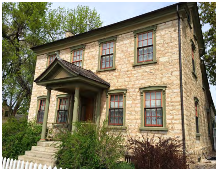
Orson Hyde Home

From Spring City we traveled a short distance to Ephraim and the Scandinavian Festival, where we enjoyed large venues of the many Scandinavian food booths, music, and crafts. We enjoyed the other activities and sites including a quilt show, car show, and historic sites/bus tour, just to name a few.