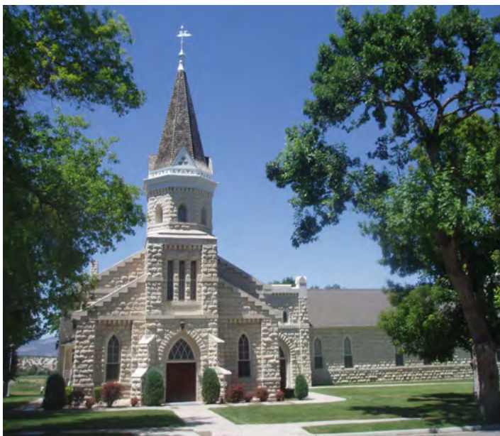
Spring City Meetinghouse