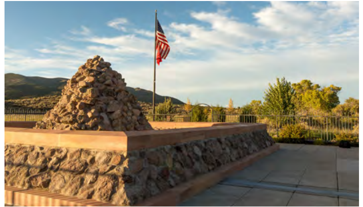
Mountain Meadows Massacre Site

From there it was on to Santa Clara to visit the Jacob Hamblin's Home, here we toured this unique pioneer home and learned about the many interesting assignments completed by this great saint and pioneer. Then we broke up for a little free time in St George. Dinner was at Chuck-A-Rama where I think it is safe to say we all over ate. Then on to our Lodging at Quality Inn.