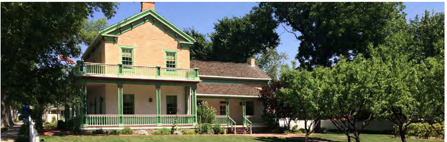
Brigham Young Winter Home

Next we moved onto Old Iron Town, a ghost town where the 2nd attempt was made to smelt iron from the mountains of iron ore found in the area. This historic site was restored and the preservation promoted by the Iron Mission Chapter of the SUP. Here we learned about the life in this community and the hardships these early pioneers endured to serve their community and church. We enjoyed a box lunch then everyone was on their own to find their way home.