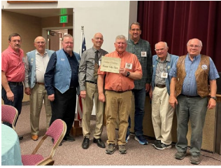
Certificate of Excellence