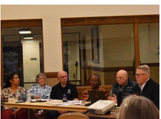
Panel of Speakers