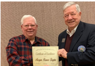
Certificate of Excellence