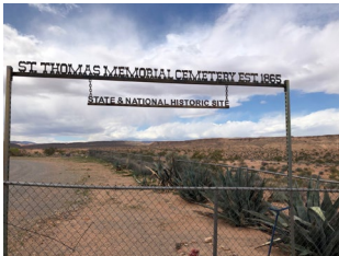
St. Thomas Cemetery