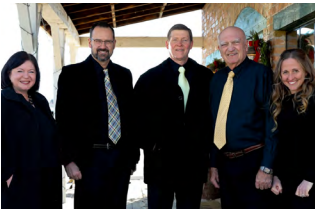
Eden's Yellow Rose

The Ogden Pioneer Chapter of the Sons of Utah Pioneers enjoyed a well-attended summer social and dinner with partners and friends on Monday, July 10. We met