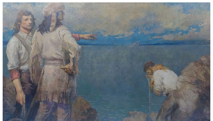
Mural at Utah State Capitol of Jim Bridger Scouting the Great Salt Lake