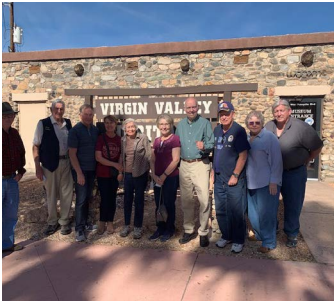
Virgin Valley Museum