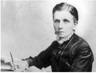
Emmeline B. Wells