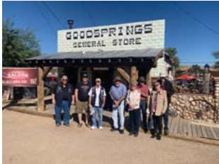
Trek to Goodsprings