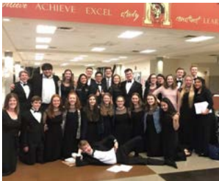
The Murray High School Madrigals

When: Wednesday, December 13, at 12pm. Please email jedavis2012@gmail.com to RSVP.