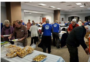
New Year's Dinner