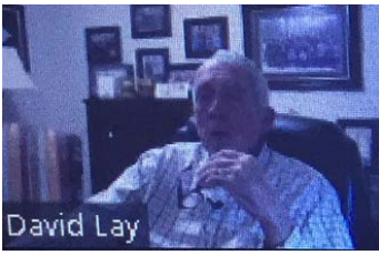
New Chapter President