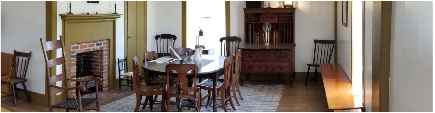
The Revelation Room - Newel K. Whitney Store

Joseph received many revelations in the Kirtland area during February, including several in the Newel K. Whitney Store. It was during this time that Edward Partridge was called as the Church's first bishop (D&C 41:9). On the 27th of February Joseph received a revelation known as the "Word of Wisdom," which established the current health code for Latter-day Saints. This revelation advises against smoking and drinking and encourages eating proper foods (D&C 89).