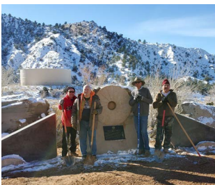
Old Grist Mill Monument

Over the last couple of months our monument committee has been busy with both a new monument and improvements to an existing monument. A new monument was erected in Newcastle, Utah, marking the route of the Old Spanish Trail through the area. Improvements were made to the Old Grist Mill monument at the mouth of Cedar Canyon to enhance its appearance and protect it.