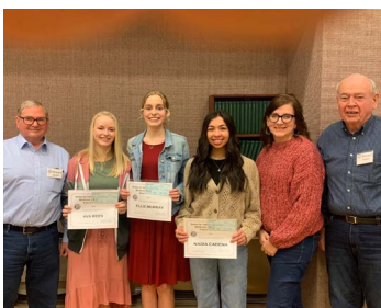
Pioneer Heritage Essay Contest Winners

The Morgan chapter of the Sons of the Utah Pioneers gathered last Monday for their monthly luncheon. A delicious smoked brisket and baked beans meal was provided by Birt's barbeque from here in Morgan. Three Morgan High School students were in attendance with their parents to receive cash awards for this year's annual Pioneer Heritage essay contest. Participants submit