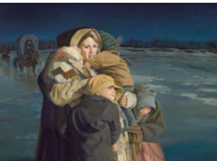
Emma Smith crossing on ice