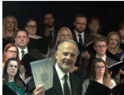
Utah Chamber Artists