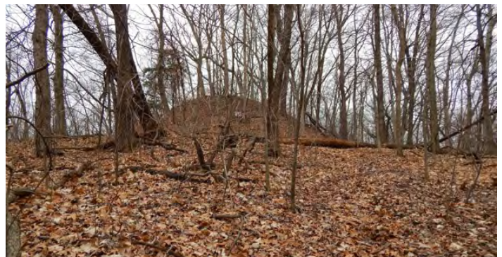
Zelph Mound, Griggsville, IL

It was near Jacksonville on the bank of the Illinois River where some of the brethren found some ancient altars and the skeleton of a man with an arrow between two of its ribs, which was made known to the prophet that he was an officer killed in battle at the last destruction among the Lamanites and his name was Zelph.