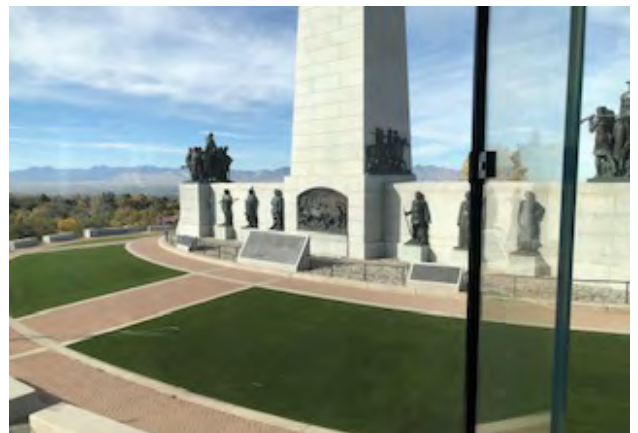
This Is The Place Monument from Visitor's Center