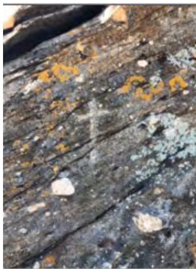
Kit Carson cross

Wanting to see this rock and the cross and to reflect upon the experience of Fremont and Carson, contact was made