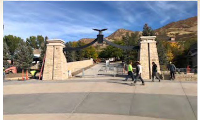
New Eagle Gate

The Executive Council and Pioneer Magazine Committee got together on October 20 and went to This Is The Place State Heritage for a tour of their new Visitor's Center and changes to the grounds. There were some beautiful additions like the Eagle Gate and Visitor's Center seen in the pictures. One of the SUP Monuments, Eyes Westward, was moved to just outside the new Visitor's Center's door. They also talked about the upcoming 2021 SUPer DUPER Day which is tentatively scheduled for July 19.