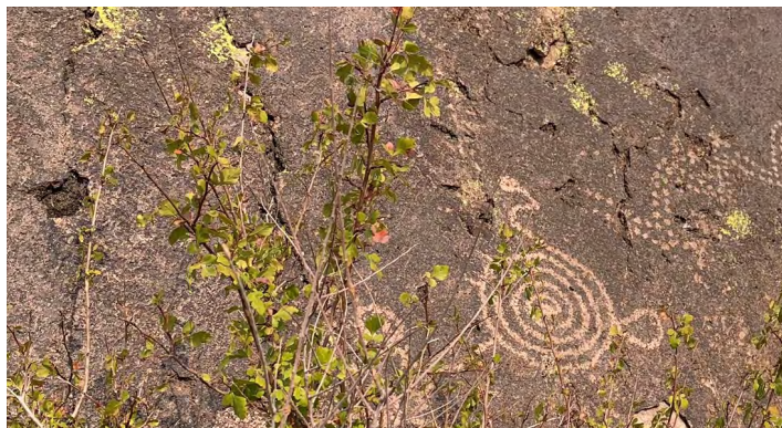
Rainbow Canyon Petroglyph

The trek was led by Al Matheson. The group was relatively small (12 people in 7 cars) in order to meet state requirements during the pandemic which we believe were successful in keeping the group safe while still providing a great activity that was shared with all chapter members in our latest newsletter.