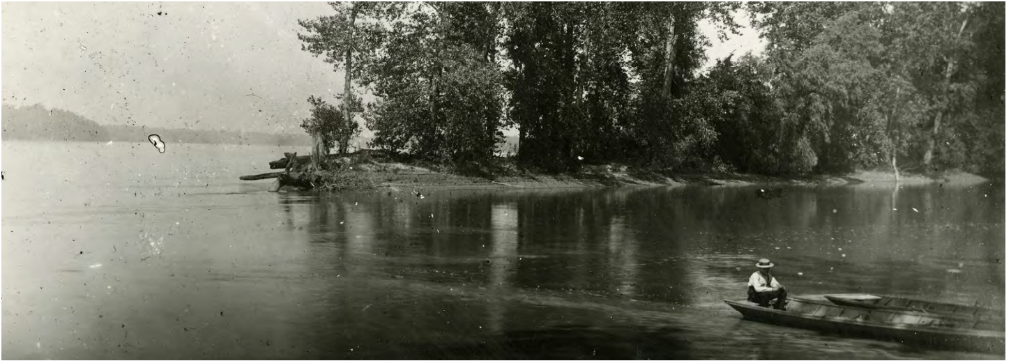
Fishing River, Clay County, Missouri