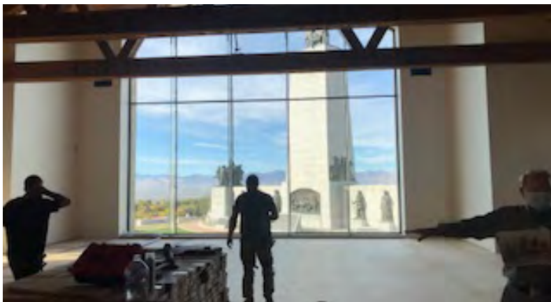
View out new Visitor's Center window