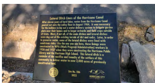
Pioneer Ditch Dedication July 24, 2023 7