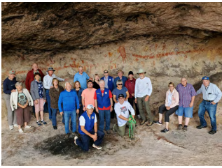
Group at Lion's Mouth