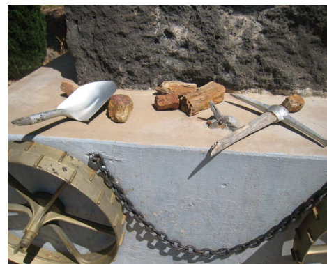
Canal Builders Tools