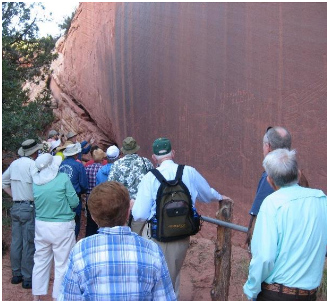
Tour members view petroglyphs

On Friday evening we traveled to the Kane County North Events Center for dinner. Afterward we adjourned to a Little League ball