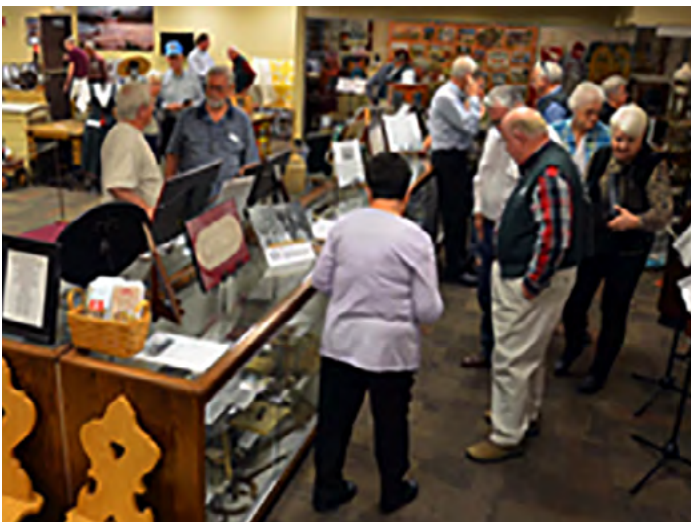
Samuel Knight Museum