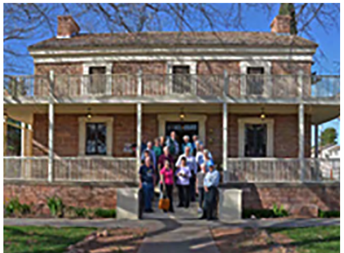
The Robert D. Covington Home