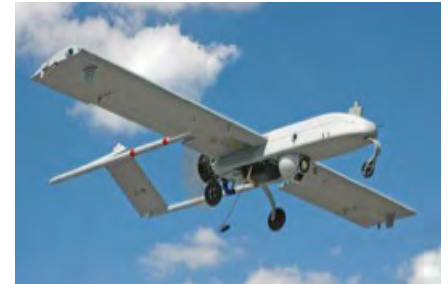
Shadow RQ Drone

and descriptive term used by proponents of the industry is Unmanned Aerial Vehicle (UAV). Drones and UAVs are considered to be fairly synonymous references although some would contend that a Drone can be differentiated by a level of automation that renders its flight dependent upon pre-programmed behaviors, as opposed to a UAV which is a remotely piloted aircraft flown by "stick and rudder" with a pilot in control. This point of differentiation, however, remains debatable. Here are some definitions for drones: