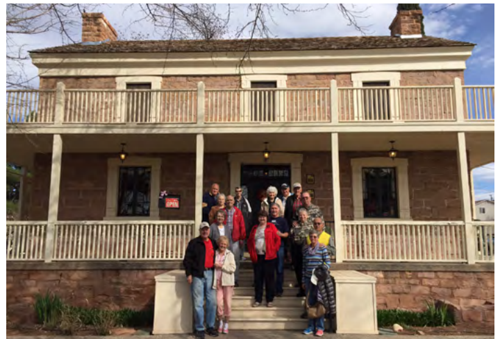
Hurricane Chapter at Covington Home

We then went to the Washington Museum located in downtown Washington. It too was very well kept, and full