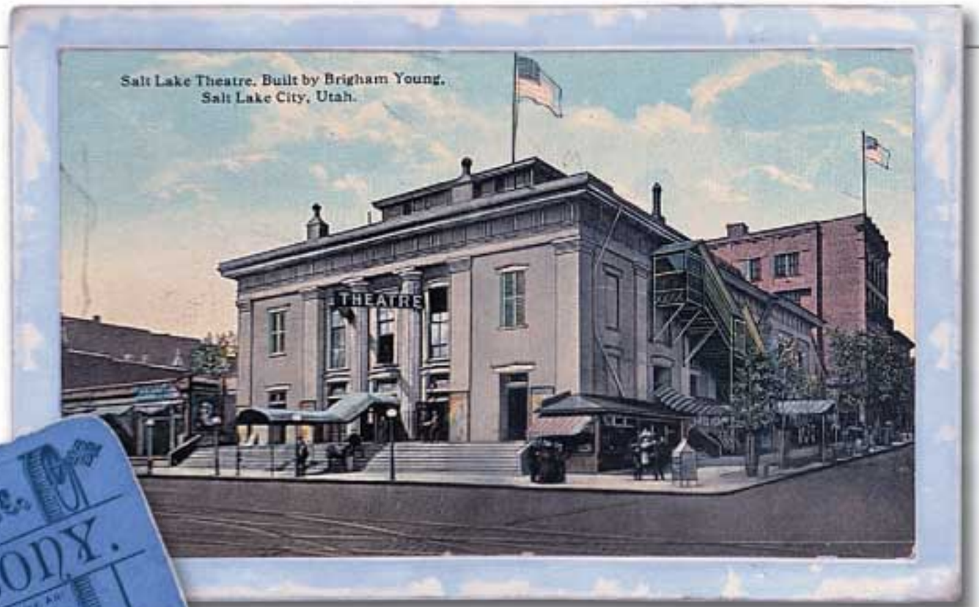
Salt Lake Theatre. Built by Brigham Young. Salt Lake City, Utah.

MANY OF THE MOST FAMOUS ACTORS AND ACTRESSES OF THE AMERICAN STAGE APPEARED AT THE SALT LAKE THEATRE.